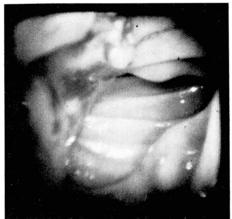
Fig. 2. Endoscopic photograph showing tumor involving duodenum.

The risk of pancreatic biopsy by any technique has been attested to by many surgeons. 3 Biopsy of lesions in the pancreas adds significantly to the risk of morbidity and mortality of any operative procedure. The possible complications include development of postoperative pancreatitis, pseudocysts, pancreatic fistulas, spread of tumor cells, hemorrhage, and peritonitis. Schultz and Sanders 4 reviewed the case histories of 159 patients who