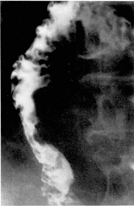
Fig. 1. Roentgenogram showing involvement of medial duodenal wall by tumor.

Efforts were made to restore renal function, and following this the patient underwent abdominal exploration at which time a palpable mass was found in the head of the pancreas. No regional lymph nodes suggestive of metastasis could be found, nor was there any evidence of metastasis to the liver, surfaces of the peritoneum, or mesentery. The only accessible area for biopsy was the tumor itself. Duodenotomy with biopsy of the medial duodenal wall was considered. However, the risks of the additional operative procedure, including the risk of spreading the tumor, caused us to consider an endoscopic approach.