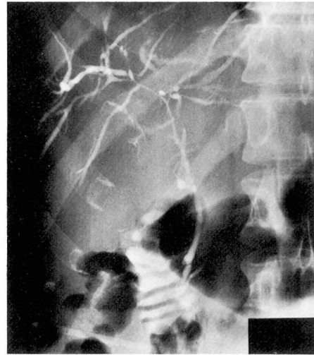
Fig. 3. Later film of narrowed biliary system. Contrast material is seen in the duodenum.

studies of the skin and liver biopsies. The patient was referred to his family physician for follow-up. In March 1974, without treatment, total serum bilirubin level was 2 mg/100 ml with a direct bilirubin of 0.3 mg/100 ml, and except for occasional malaise at the end of the day, he had no symptoms.