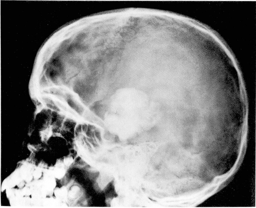
Fig. 1. Case 7. Plain skull roentgenogram, lateral view showing large temporal calcified mass.