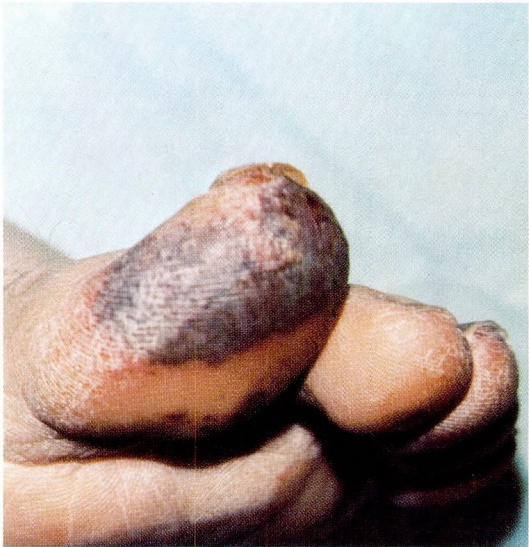
Fig. 4. Case 4. Infarction of the great toe.