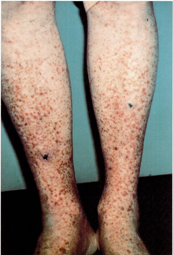
Fig. 3. Case 4. Cutaneous vasculitis with palpable purpura.