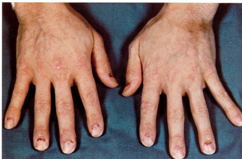
Fig. 2. Case 4. Periungual infarcts.

On admission to Cleveland Clinic he was acutely ill. Examination of the skin revealed