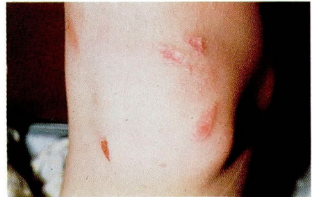
Fig. 3. Typical scarring of EDS, mild (brother of patient).

crusted papules on the nose and chin. Echinomoses were absent and the tongue was not hyperextensible (negative Gorlin's sign). Examination of the patient's mother revealed mild skin stretchability and moderate joint laxity. The patient's 10-year-old brother had several scars on the elbows and knees identical to those seen on the patient (Fig. 3); his skin was mildly hyperextensible and the joints of his hands were moderately lax. Results of physical examination of the father of the patient and a 15-year-old brother were normal.