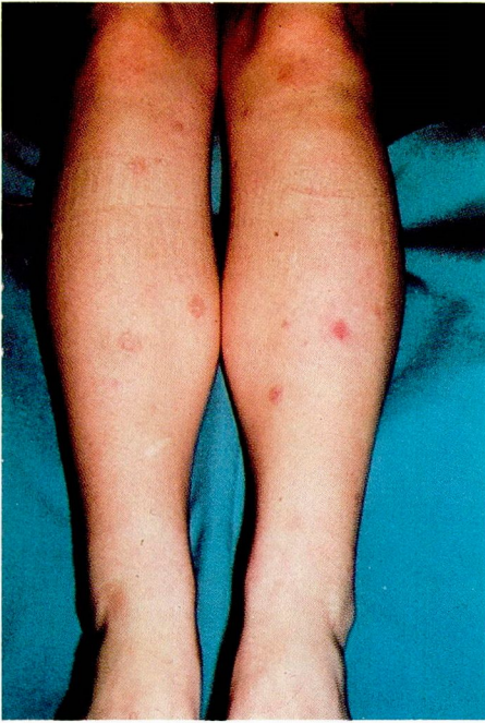
Fig. 1. Typical scarring of EDS, mild (patient).