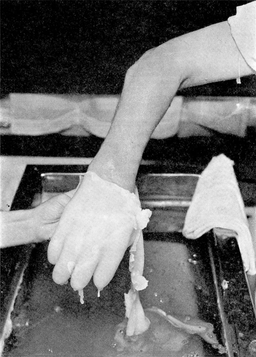
FIGURE 3: Removal of paraffin glove after treatment, showing typical hyperemia.

If exercise is prescribed, squeeze and mold piece of warm paraffin in the hand before putting back in boiler.