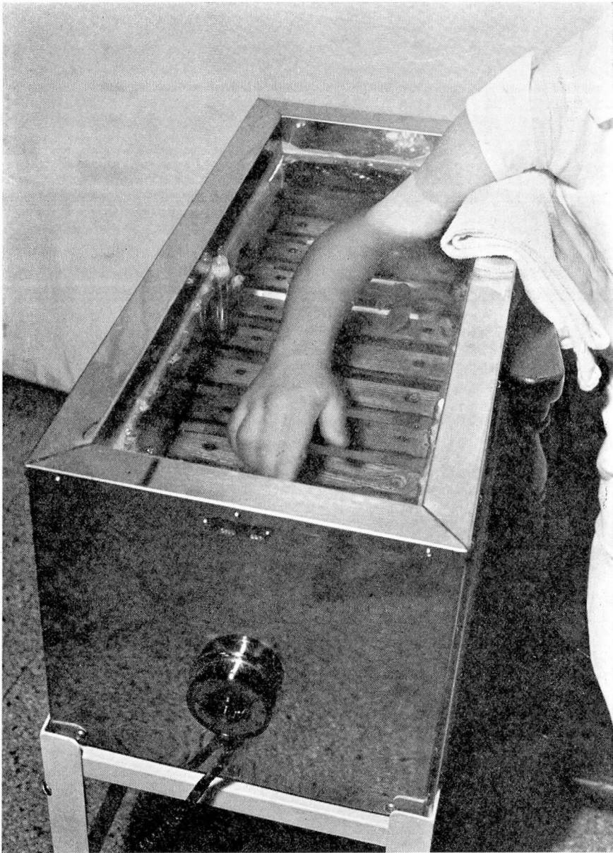
FIGURE 1: Paraffin bath for hand and arm.

(6 to 8 pounds) and the lower part with hot water. Heat until almost all the paraffin is melted but be sure an unmelted piece remains. This is important if burns are to be avoided. Remove from fire, leaving water in bottom of boiler.