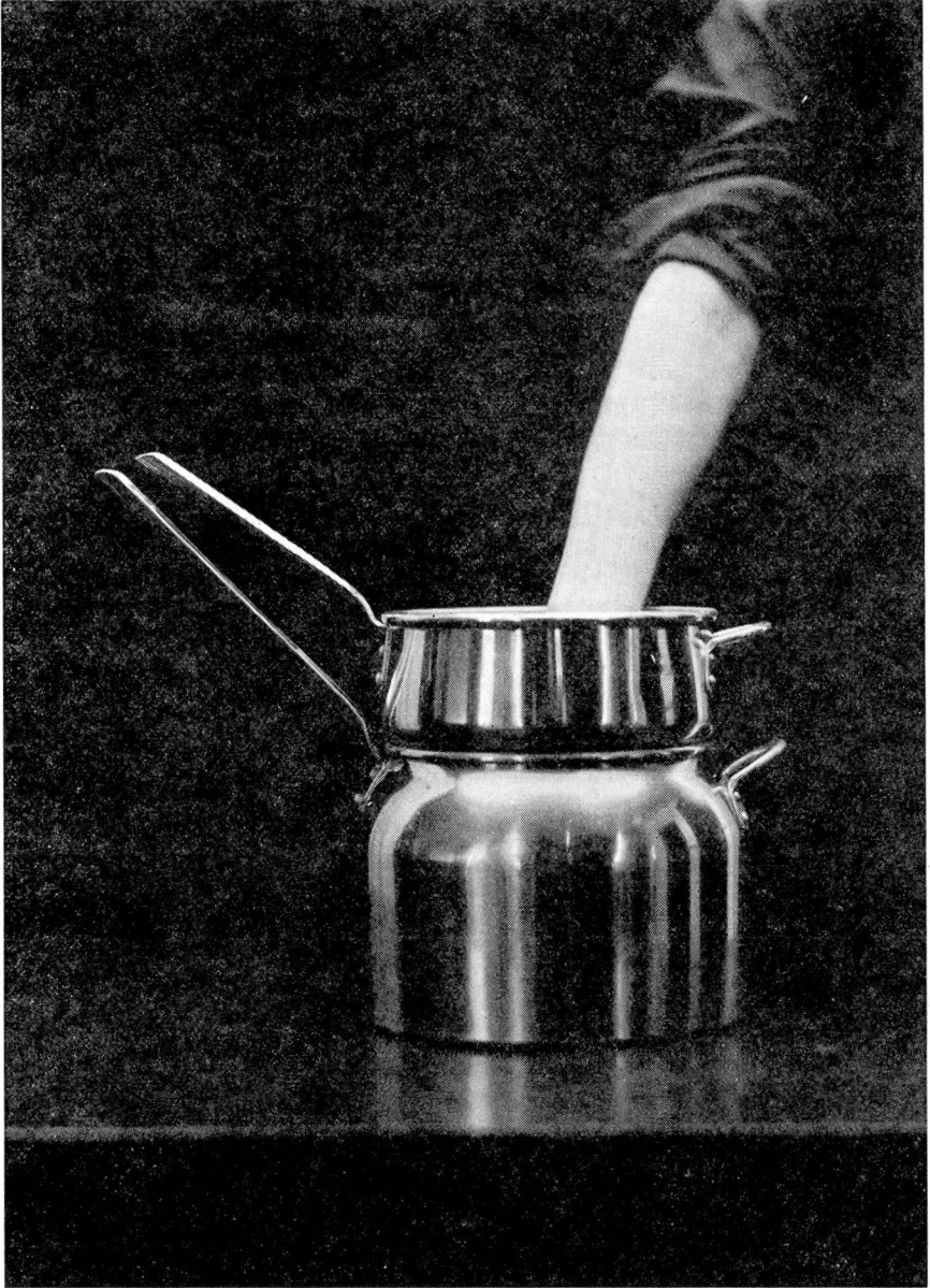
FIGURE 4: Double boiler for home treatment of hand and wrist.

is allowed to cool until it begins to congeal on the surface it will be perfectly safe to use.