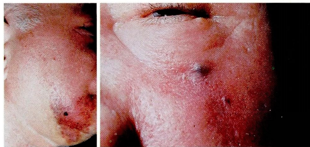
Figure 1. Poorly demarcated, purple plaque with dark papule on right jawline.

The history of progressive facial swelling in an elderly man with the presence of poorly demarcated, indurated, vascular plaques on the head established the diagnosis of angiosarcoma in our patient; micro-