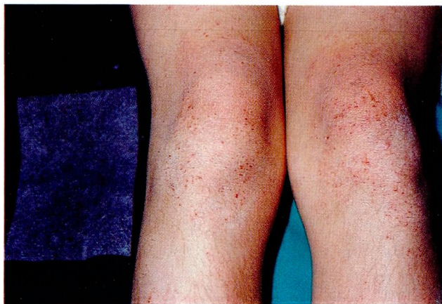
Figure 1. Eczematous dermatitis of the knees (patient 1) and knee patch on the inside of the pant leg.

Further patch testing in July 1981 showed a strong 3+ reaction to the epoxy resin, Epon ® 828 (0.5% pet), and negative patch tests to a new knee patch supplied by Sears. The dermatitis resolved promptly following changing to jeans without knee patches and application of betamethasone valerate ointment 0.1%. There had been no recurrence