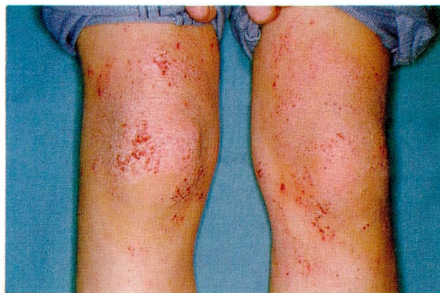
Figure 4. Patchy eczematous dermatitis of the knees (patient 3).

The condition responded promptly following avoidance of Toughskin® jeans and 24-hour occlusion with betamethasone valerate cream 0.1%, twice in a 72-hour period.