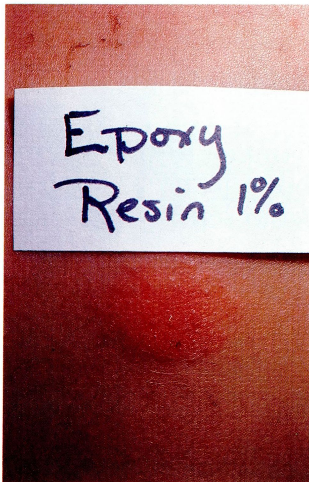
Figure 2. Positive patch test to epoxy resin (Epon ® 825) (patient 1).

of the dermatitis when the patient was seen four months later.