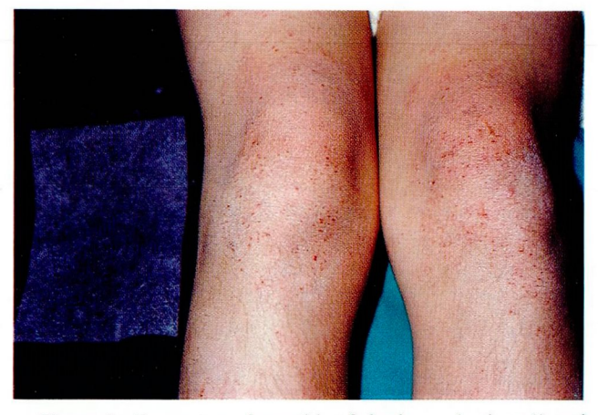
Figure 1. Eczematous dermatitis of the knees (patient 1) and knee patch on the inside of the pant leg.

Further patch testing in July 1981 showed a strong 3+ reaction to the epoxy resin, Epon<sup>®</sup>828 (0.5% pet), and negative patch tests to a new knee patch supplied by Sears. The dermatitis resolved promptly following changing to jeans without knee patches and application of betamethasone valerate ointment 0.1%. There had been no recurrence