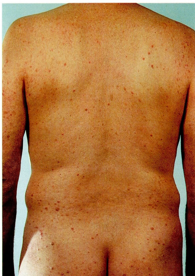
Figure 1. Clusters of salmon-pink papules on the trunk and arms.