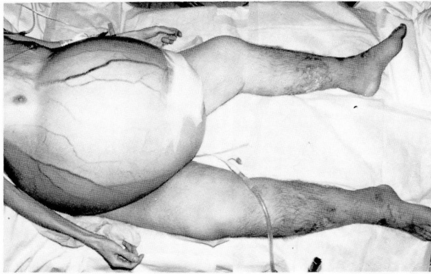
Fig. 1. Patient shortly after admission.

dl; total protein, 7.7 g/dl; albumin, 3.2 g/dl; and uric acid, 9.7 mg/dl. Immediate measures were instituted to correct the hyperkalemia and dehydration. Following intravenous hydration, laboratory values were: hemoglobin, 8.7 g/dl; hematocrit, 27%; white blood cell count, 14.0 \times 10^9/L ; platelets, 213 \times 10^9/L ; serum sodium, 128 mEq/L; serum potassium, 4.7 mEq/L; BUN, 73 mg/dl; serum creatinine, 1.0 mg/dl; total serum protein, 5.7 g/dl; and serum albumin 2.6 g/dl. Gynecologic consultation was obtained, and the diagnosis was probable giant mucinous cyst of the ovary. Skin testing for mumps, Candida , Trichophyton , and purified protein derivative (PPD) were all negative. Hyperalimentation was initiated on the third hospital day.