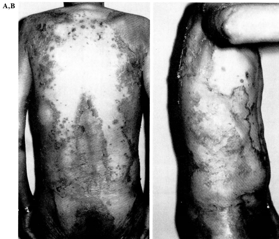
Fig. 1. A and B. Discrete and confluent erythematous annular erosive scaling plaques, many of which are serpiginous, on the trunk, buttocks, and extremities.