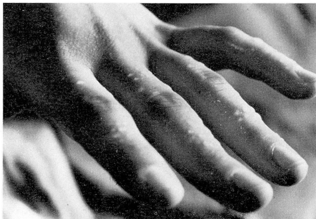
Fig. 1. Visible perspiration on the dorsum of the fingers.

two sheets of paper, one sheet acting as an absorbent shield over the written copy. Many avoid shaking hands or apologize after having done so. One embarrassed patient would adjust her store purchases to an even dollar so as to prevent having to receive change in her hand. Most find it necessary to wear absorbent undergarments, layered clothing, and dark coordinates as camouflage. Some have even undergone serious personality changes and still others have withdrawn from society altogether. 2,3