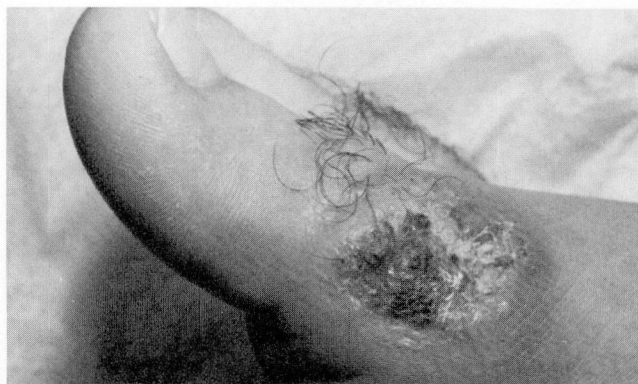
Fig. 1. Large verrucous, fissured nodule with focal vascular thromboses on the right dorsomedial metatarsal head.