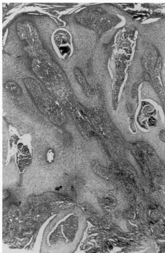
Fig. 2. Marked pseudoepitheliomatous hyperplasia of the epidermis and focal intraepidermal abscess formation. A dense chronic inflammatory infiltrate is present in the dermis (hematoxylin-eosin, original magnification \times 40 ).

black dots on the right dorsomedial aspect of the first metatarsal head (Fig. 1). There was no regional lymphadenitis or lymphadenopathy, and the lung fields were clear