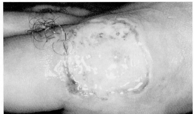
Fig. 4. One week postoperatively, the wound is healing with healthy granulation tissue and no evidence of secondary infection.

Because of the small number of cases reported, there is no uniform therapy for primary inoculation blastomycosis. Previously reported treatment has included surgical excision or local debridement, soaks, potassium iodide, amphotericin B, or radiation treatment. 9 The first reported