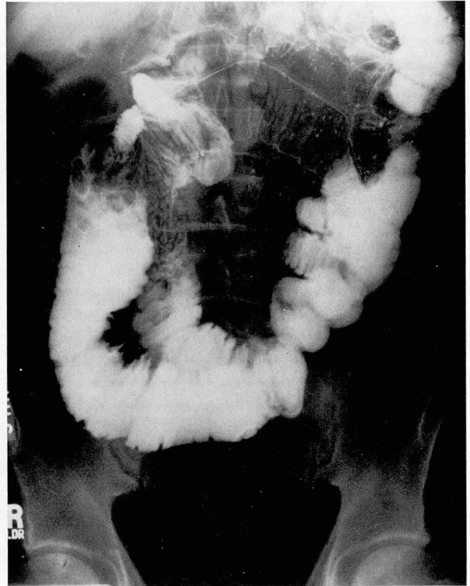
FIG. 3. Case 4. Radiograph from repeat small bowel series showing marked dilatation of loops of the ileum and spiculated appearance of the mucosa.