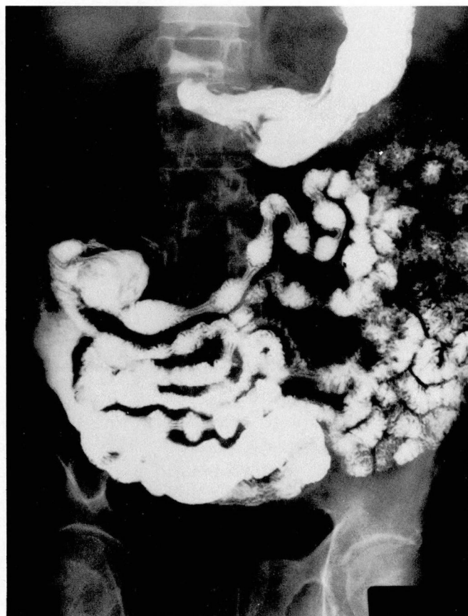
FIG. 1. Case 2. Radiograph from small bowel series showing multiple areas of narrowing and irregularities of the distal ileum, with mild prestenotic dilatation.