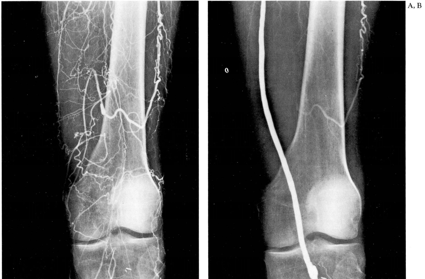
FIGURE 5A. Thrombosis of in situ saphenous-vein femoral-popliteal bypass. Note collateral from profunda femoris and poor distal reconstitution of vessels. FIGURE 5B. Patency of bypass is restored after four hours of t-PA administration. Stenotic distal anastomosis (not shown here) required revision to maintain patency of bypass.

thromboplastin time, or by clotable fibrinogen assay. With the exception of the latter assay, these methods are not very sensitive or specific. Furthermore, laboratory evaluation to establish presence of a lytic state does not indicate clot lysis or herald complications. 112,113 Laboratory analysis informs the clinician that the intended reaction of plasminogen activator is occurring. To determine whether clot lysis has occurred, the investigator must look for presence of circulating fibrin fragments including D-dimer and B-BETA 15-42 subunits. However, the levels of these fragments are of little value for clinical monitoring. Instead, we generally measure thrombin time, fibrinogen level, and hematocrit twice daily.