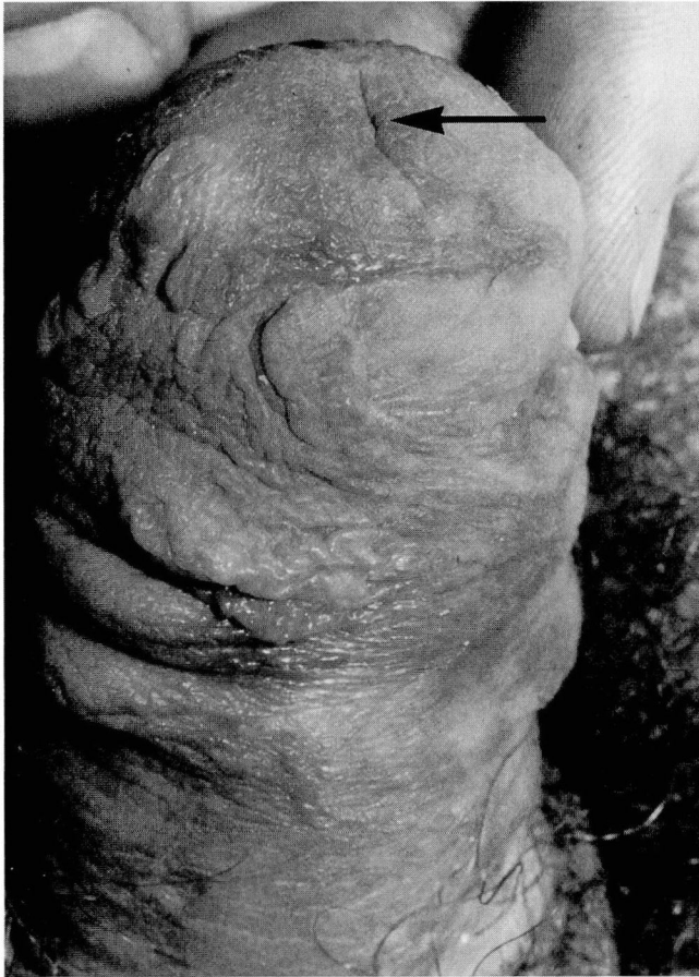
FIGURE 1. Case 1. Successful Mathieu hypospadias repair with meatus (arrow) at tip of glans penis.

had needed to sit to urinate during his entire life. On physical examination, the patient had distal hypospadias (Figure 2). Hypospadias reconstruction had not been performed in childhood because of financial considerations. The patient had desired repair of his hypospadias since early childhood for functional as well as cosmetic reasons. He denied any difficulty with intercourse despite a mild chordee. He had three children. An artificial erection revealed a mild chordee, and he successfully underwent a Mathieu hypospadias repair with a scrotal rotational flap to cover the ventral skin defect (Figure 3). The postoperative result was excellent, and the patient was able to void well with a straight stream (Figure 4).