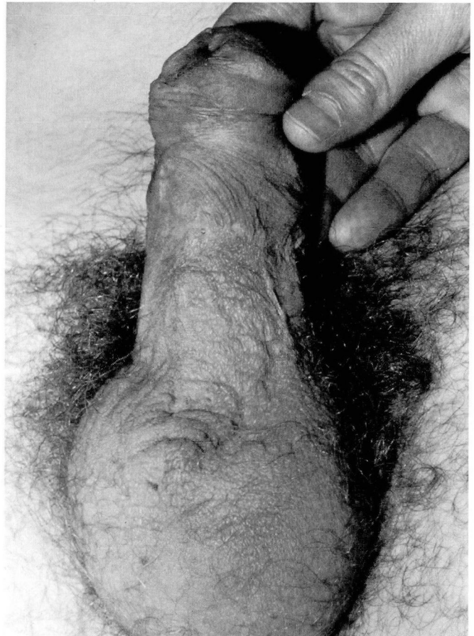
FIGURE 4. Case 2. Successful Mathieu hypospadias repair with excellent coverage of ventral penis.

Several technical problems in adult hypospadias reconstruction seem to be magnified when compared to the same anatomical abnormality in children. These problems include skin limitations and postoperative erections. We have observed that the amount of redundant foreskin available for repair compared to the size of the penis is less in adults than in children. Also adult skin is thicker and has stronger intracellular attachments and stiffer collagen bonds. 6-8 These factors, when combined, make coverage of skin defects more difficult in adults than in children, particularly if a chordee is present. To compensate for the potential skin defects, the use of scrotal and other skin flaps may be necessary to obtain adequate skin coverage after hypospadias repair, as seen in Case 2 (Figure 4).