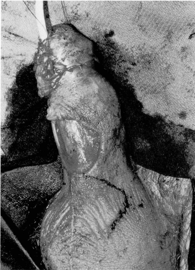
FIGURE 3. Case 2. Ventral skin defect after Mathieu repair.