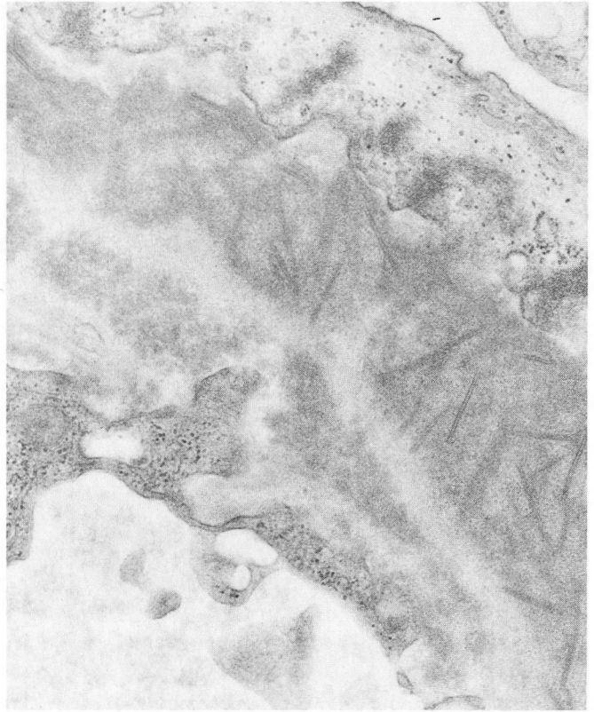
FIGURE 2. Electron photomicrograph demonstrating epimembranous and intramembranous dense deposits. The dense deposits appear to be in part tubular. There is no evidence of amyloid fibrils. Lead citrate and uranyl acetate \times 21,000 .

The renal biopsy revealed membranoproliferative glomerulonephritis (Figures 1 and 2). Biopsy of the ur-