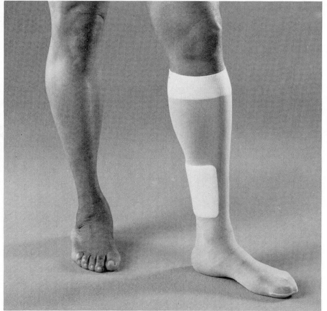
FIGURE 2. The Allevyn dressing is held in place by a light-weight compression liner stocking.

time, and the patient adds the heavy support stocking before arising in the morning.