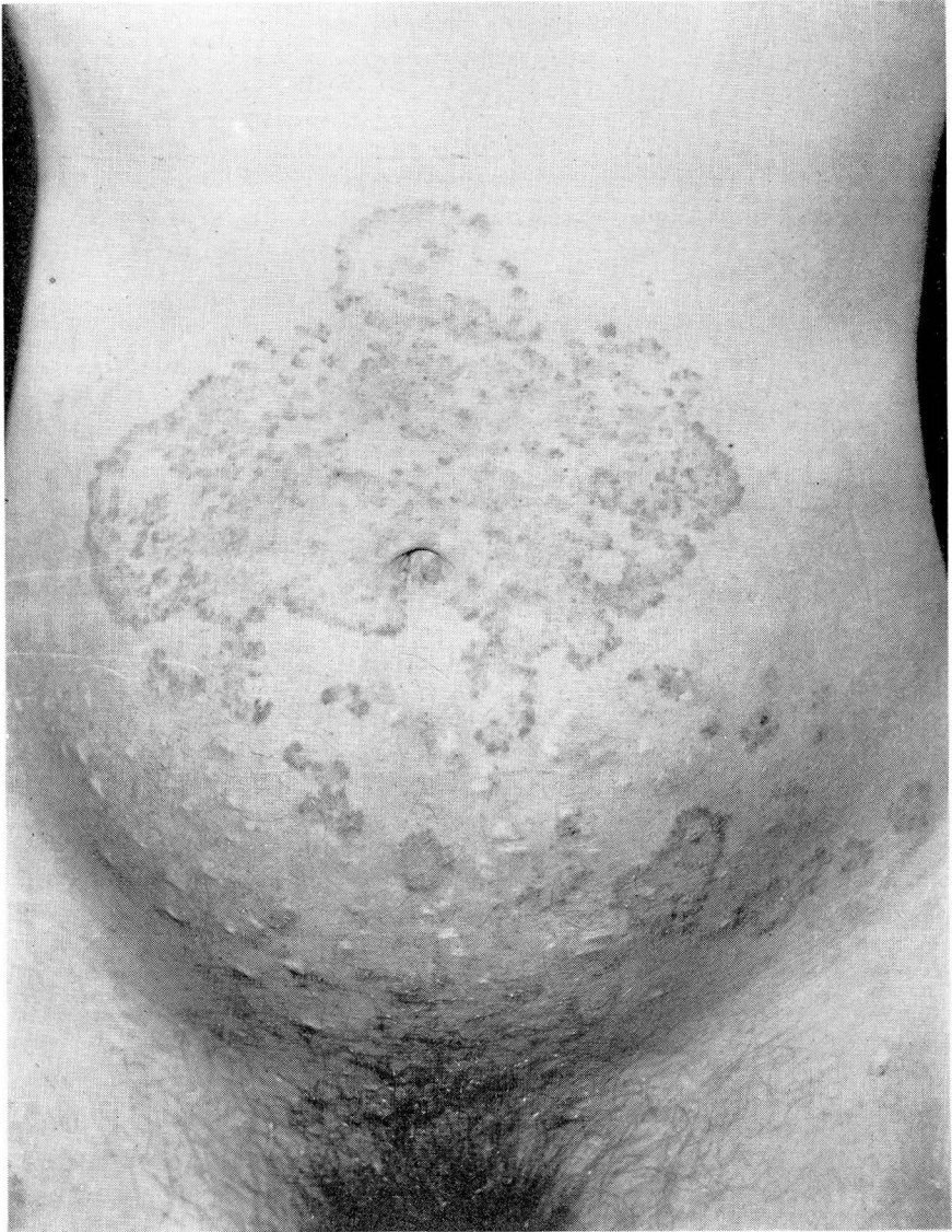
FIGURE 4: Disseminated tinea corporis. Scales showed many fungous hyphae. Note sharp, serpiginous, vesicular border of large lesion on abdomen, and new lesions within the larger ones. Compare with figures 1, 2, and 3.

base of the nose, midportion of the chest and interscapular region. Erythematous patches are likely to be in the axillae or beneath the breasts of women. The lesions have a characteristic yellowish pink color with more abundant, coarser, and greasy scales. In contrast the four characteristics listed above for the diagnosis of pityriasis rosea