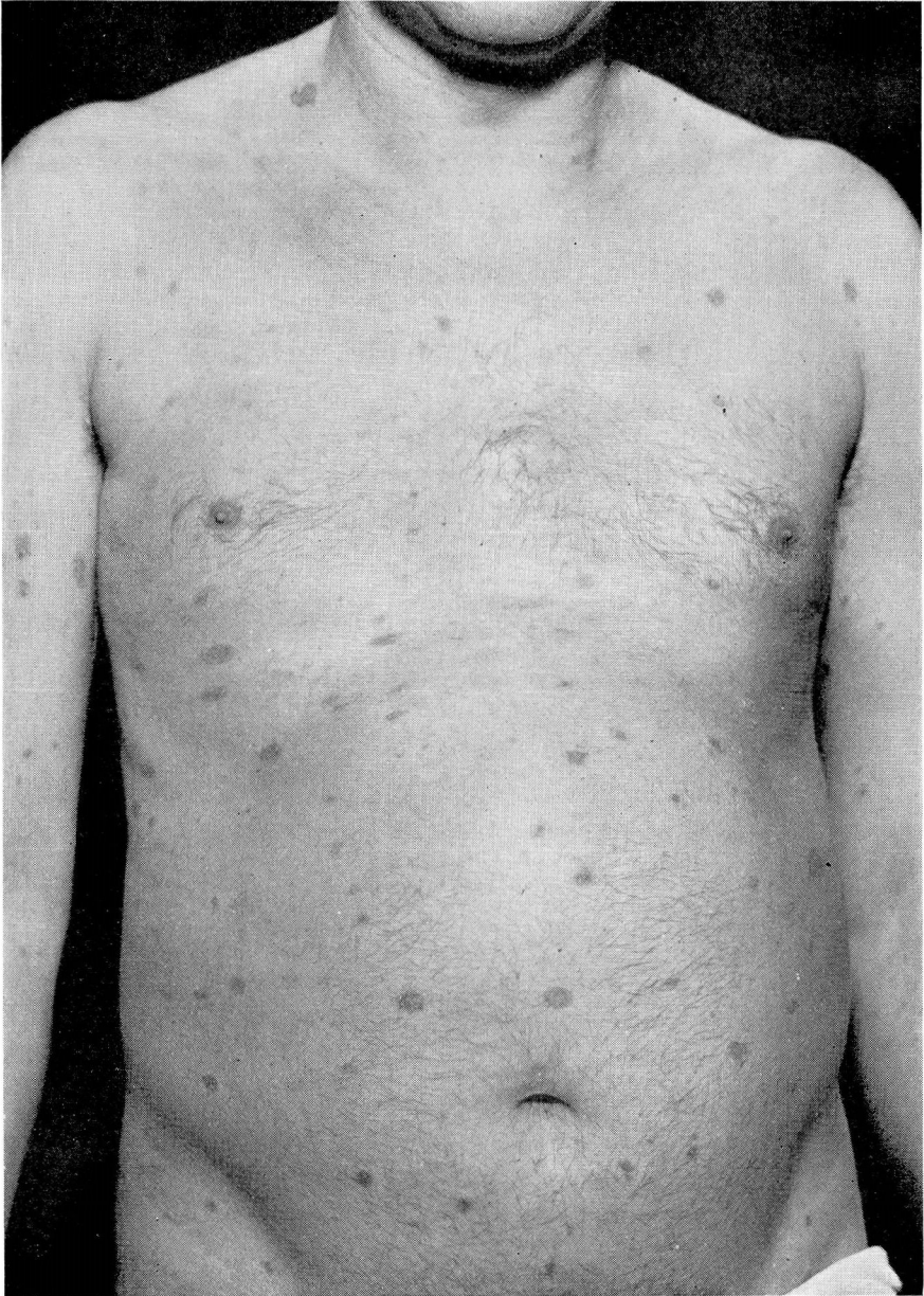
FIGURE 1: Macular type of pityriasis rosea. Note herald plaque on the neck and distribution of macular lesions with axial arrangement along lines of cleavage.