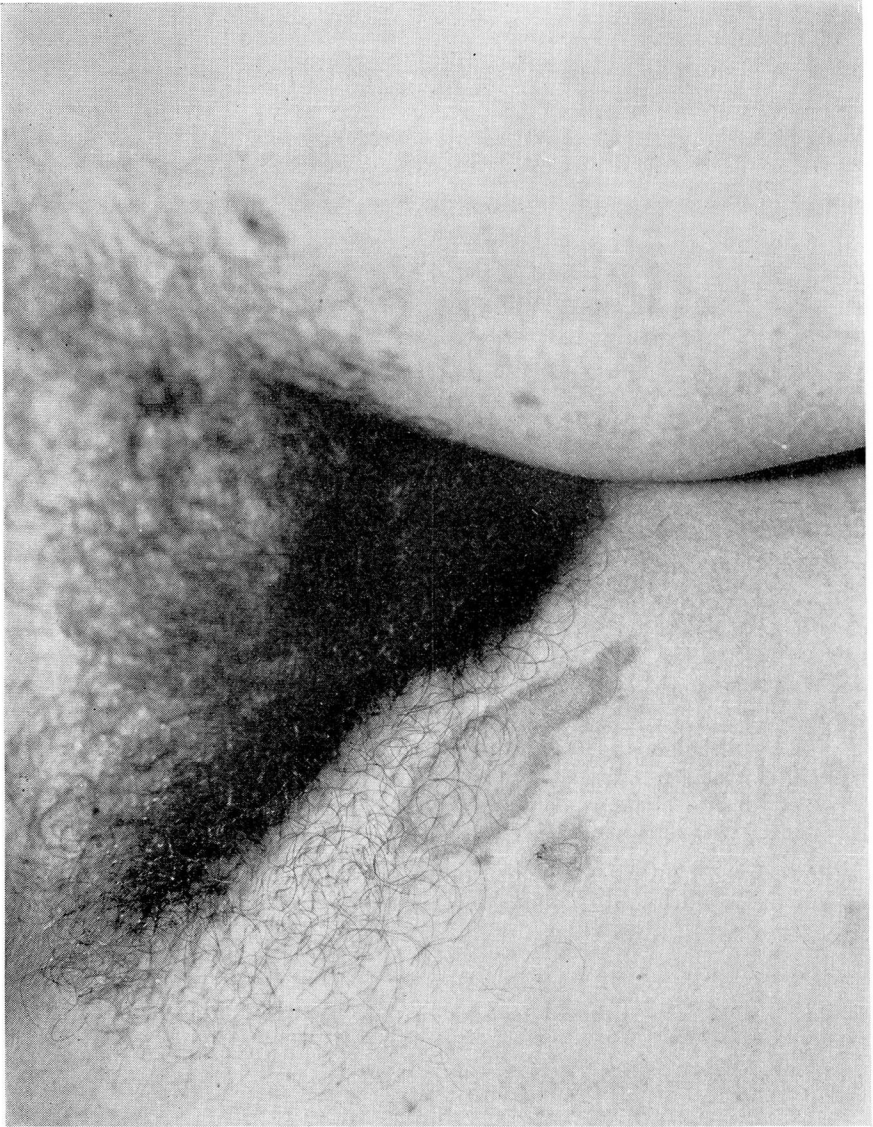
FIGURE 3: Herald plaque of pityriasis rosea. Compare with figure 4.

All the patients in our series had routine laboratory examinations including blood Wassermann and Kahn tests. Of the series only four patients had syphilis, two of whom had late syphilis and pityriasis rosea developed during anti-syphilitic treatment. In the third case which was being treated for acute syphilis, the eruption occurred during the week following the last injection of the first course of neoarsphena-