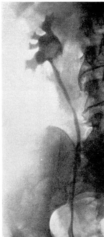
FIGURE 1: Retrograde pyelogram showing a punched-out filling defect, with slightly moth-eaten edges at the ureteropelvic junction of the right kidney, probably a tumor. Overlying this shadow was a larger, less dense filling defect, the edges of which were smoother. This was interpreted as a blood clot.