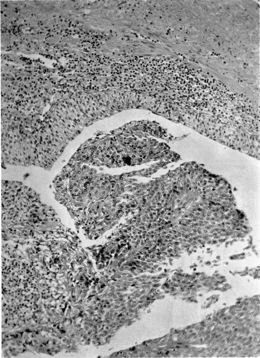
FIGURE 4: Photomicrograph of section through tumor.

carcinoma, and papillary carcinomas. The average age of the patients in this group was 57 years. Twelve tumors occurred in males while only one was found in a female. The side most commonly involved was the left, nine occurring on this side and four on the right.