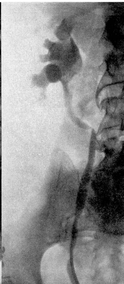
FIGURE 2: Recheck retrograde pyeloureterogram showing the same filling defect and a normal ureter. The final interpretation was tumor at the ureteropelvic junction of the right kidney pelvis.

in the pelvis could be felt on gentle palpation. The ureter was exposed and appeared entirely normal. It was severed as close to the bladder as possible through the kidney incision. The remainder of the procedure was without incident.