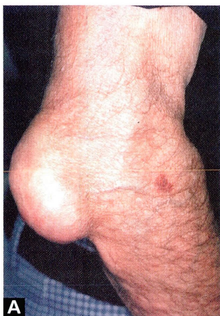
A Tophus on the elbow.

After uric acid levels return to normal, the tophi usually resolve over time. The perils of nontreatment are illustrated in another patient, whose gouty tophus eroded through the skin, resulting in secondary infection with staphylococcus aureus (C).