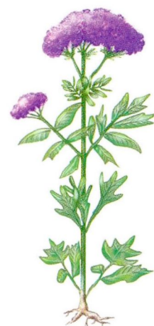
Valerian ( Valeriana officinalis )

should be avoided to minimize the risk of serotonin syndrome. Serotonin syndrome is characterized by confusion, shivering, agitation, fever, diaphoresis, diarrhea, myoclonus, hyperreflexia, and tremor. However, no study of systemic interactions with drugs or food has been conducted.