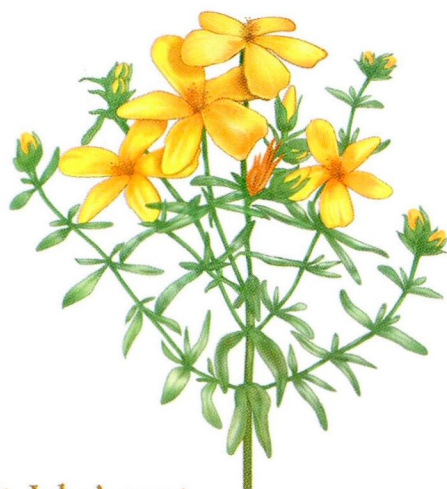
St. John's wort ( Hypericum perforatum )