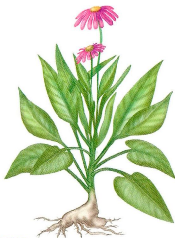
Echinacea ( Echinacea angustifolia , purple coneflower)

Echinacea , also known as purple coneflower and snakeroot, has been promoted for preventing cold and flu symptoms. Although its mechanism of immune stimulation is unknown, it may work by stimulating the production of phagocytes. 25