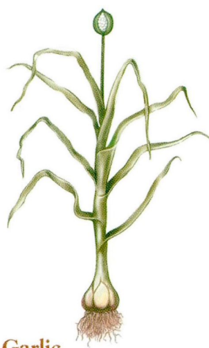
Garlic ( Allium sativum )