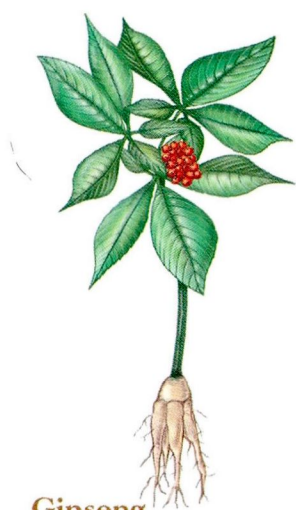
Ginseng ( Panax schinseng )