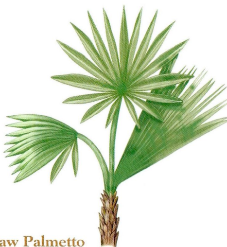
Saw Palmetto ( Serenoa repens )

Saw Palmetto is widely used in Europe to treat benign prostatic hyperplasia (BPH). In fact, up to 90% of patients with BPH in Europe take herbal medications, and 50% of European urologists prefer herbs to alpha blockers.