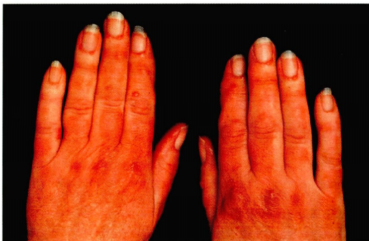
FIGURE 4. Periungual nodules in a patient with multicentric reticulohistiocytosis. A cutaneous hallmark of multicentric reticulohistiocytosis are nail-fold nodules, arranged in a "coral bead" pattern. In patients with extensive facial, nasal, and paranasal nodular disease, disfigured leonine facies may result. This can also be seen in patients with leprosy or Sezary syndrome. The nodules range in size from a few millimeters to several centimeters and are a light copper to dark reddish-brown color. They are usually firm and nontender. Pruritus is reported in one third of patients.

Gout. Gouty tophi are differentiated from the nodules of multicentric reticulohistiocytosis by their location in the elbow, ears, Achilles tendon area, and first metatarsophalangeal joint region. Gouty tophi are not