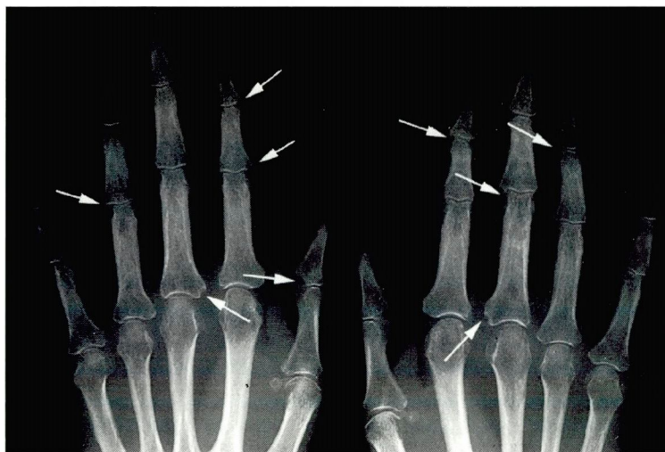
FIGURE 1. Multicentric reticulohistiocytosis. Radiograph of the patient from the case report demonstrates destructive changes in the proximal and distal interphalangeal joints and metacarpophalangeal joints (arrows) with erosions and joint space narrowing. Note lack of periarticular osteopenia.