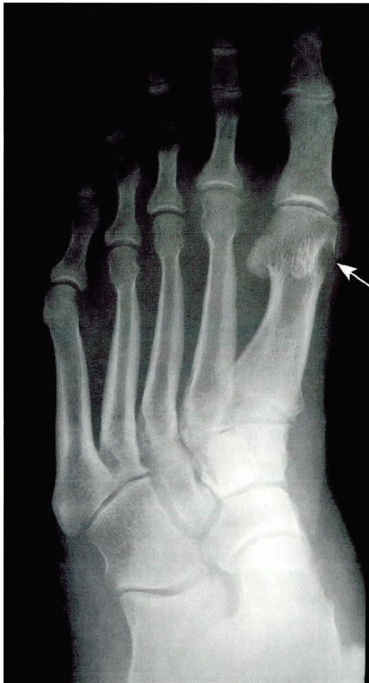
FIGURE 7. Gouty arthritis. Foot radiograph of a patient with gouty arthritis that displays the characteristic punched-out erosion of the first metatarsal with an overhanging ledge (arrow) and normal joint space.