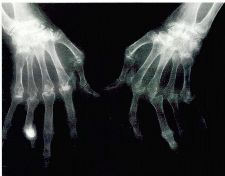
FIGURE 5. Rheumatoid arthritis. Hand radiograph of a patient with rheumatoid arthritis, showing prominent periarticular osteopenia. There is also erosive disease with joint space narrowing and subluxation of the metacarpophalangeal joints as well as proximal interphalangeal joint narrowing and erosions and joint space narrowing involving the wrist. Note the symmetrical findings.