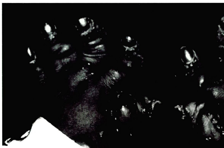
FIGURE 3. Multicentric reticulohistiocytosis. Hands show multiple dermal nodules and shortened fingers with the characteristic telescoping deformity sometimes compared to an accordion or opera glass ( le main en lorgnette ). The deformity is due to destruction of both the distal and proximal interphalangeal joints. 4 Note the short, stubby fingers and the overlying wrinkled skin, which can be stretched back to their normal length. These deformities can also be seen in patients with rheumatoid or psoriatic arthritis. The overall pattern of joint involvement in multicentric reticulohistiocytosis is similar to what is seen in rheumatoid arthritis. However, distal interphalangeal joint involvement, which is classic for multicentric reticulohistiocytosis, is not a normal feature of rheumatoid arthritis. Any peripheral or axial joint may become involved.

SOURCE: EAGLE RC JR, PENNE RA, HNELESKI IS JR. EYELID INVOLVEMENT IN MULTICENTRIC RETICULOHISTIOCYTOSIS. OPHTHALMOLOGY 1995; 102: 426-430.