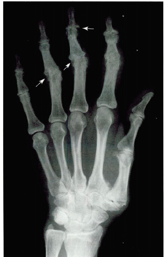
FIGURE 8. Erosive osteoarthritis. Hand radiograph of a patient with erosive osteoarthritis involving the distal and proximal interphalangeal joints with normal metacarpophalangeal joints and a somewhat "seagull" appearance to the second and third distal interphalangeal joints.