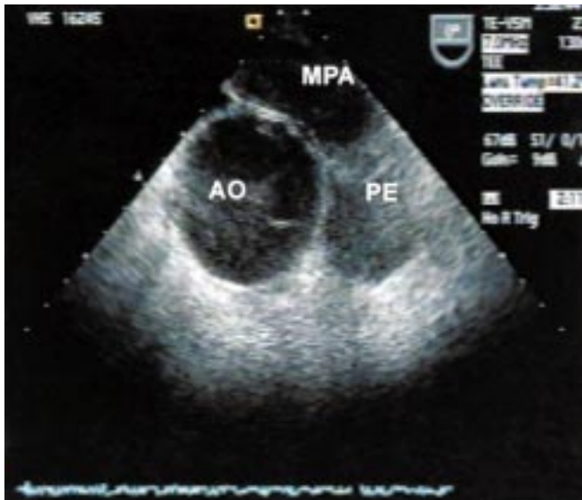
FIGURE 2. Aorta (AO) with obstruction of main pulmonary artery (MPA) by pulmonary embolus (PE).