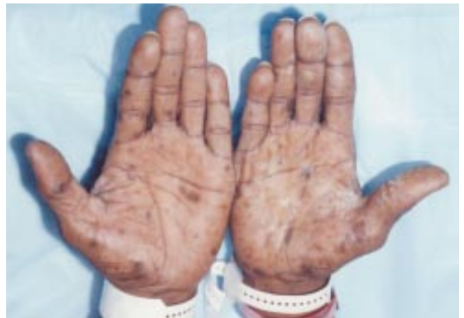
FIGURE 1. The rash was pruritic and symmetrically distributed

Q: A 44-YEAR-OLD MAN with a history of hypertension and end-stage renal disease presents with a pruritic skin rash lasting 6 months. The rash (FIGURE 1) is symmetrically distributed on the trunk, the palms, and the flexor aspect of the forearms and legs. He has no oropharyngeal lesions and no involvement of the genitalia.