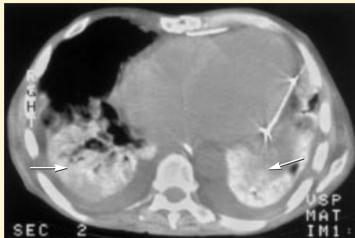
FIGURE 1. A computed tomographic scan without contrast in a patient receiving amiodarone reveals infiltrates in both lung bases (arrows), due to the iodine content in amiodarone. This enhancement, however, is not pathognomonic for amiodarone toxicity.