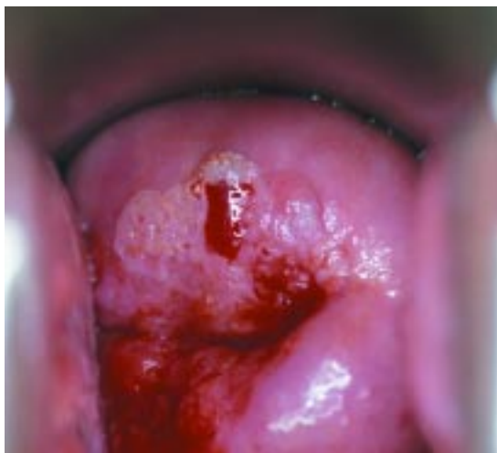
FIGURE 1. Colposcopic view of various stages of cervical dysplasia. Top, grade 1 cervical intraepithelial neoplasia. Middle, grade 3 cervical intraepithelial neoplasia. Bottom, cervical cancer (6 to 9 o'clock) in a background of grade 3 intraepithelial neoplasia.

tion, hyperkeratosis, and parakeratosis are all highly associated with HPV infection and identify neoplastic cervical precursor lesions with a high degree of accuracy. In fact, the success of the Pap smear in cervical cancer screening programs has served as a model for population-based screening, early detection, and treatment. Since the introduction of Pap screening in the United States, the incidence and mortality of cervical cancer have declined by more than 40%. 12