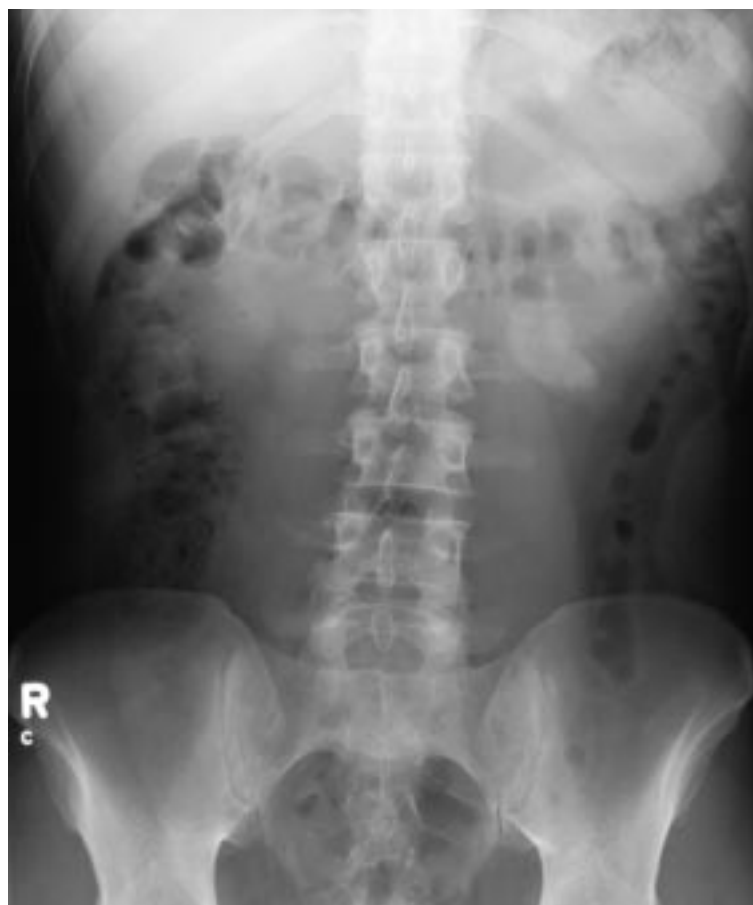
FIGURE 1. The patient's symptoms plus the finding of enemas and over-the-counter laxatives among the patient's belongings prompted the emergency department to obtain this abdominal radiograph.

then either ingesting them or inserting them rectally or vaginally.) The threshold for cocaine to precipitate seizures appears to decrease over time in cocaine abusers.