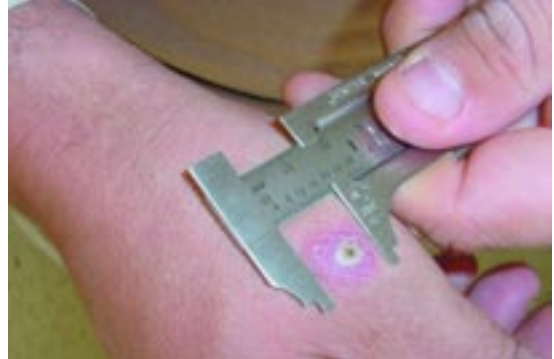
The US Army has had more than 600 cases of leishmaniasis