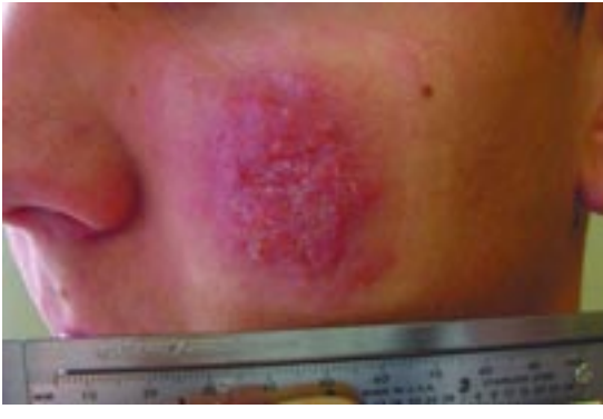
FIGURE 1. Top, psoriaform plaque on extensor surface of knee: middle, central eschar on thumb; bottom, papular eruption on cheek.