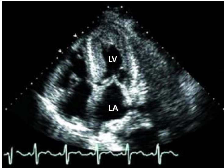
FIGURE 2. Two-dimensional transthoracic echocardiographic image in the apical four-chamber view of a patient with hypertrophic cardiomyopathy showing severe left ventricular hypertrophy. LV = left ventricle, LA = left atrium.

Clinicians need to know the implications of a positive or a negative genetic test