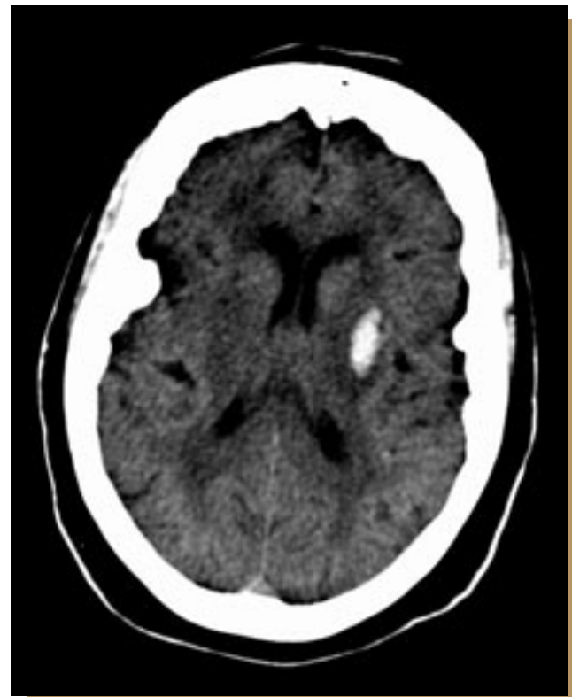
FIGURE 1. A noncontrast CT image of a different patient with malignant hypertension who developed an intraparenchymal hemorrhage in the left globus pallidus. Thrombolytic therapy would likely cause serious complications in this patient.

Thrombolytic therapy is most successful when started within 3 hours of the onset of symptoms. After 3