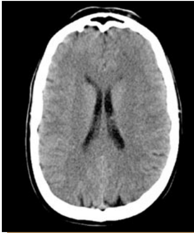
FIGURE 2. A noncontrast CT image of the brain through the level of the corona radiata is normal, with normal differentiation of the gray and white matter and no mass effect or intracranial hemorrhage.

may be the source of emboli. Similarly, echocardiography can be used to evaluate the heart for mural thrombus or valvular vegetations. Transcranial Doppler ultrasonography can show lack of flow in the cerebral vessels or waveform changes that suggest a more distal obstruction.