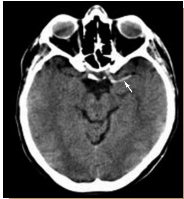
FIGURE 3. A CT image through the level of the internal carotid artery terminus showed a curvilinear density just lateral to the left anterior clinoid process (arrow). This finding represents embolism within the left internal carotid artery.

Cerebral radionuclide scintigraphy has no role in the evaluation of acute stroke because it takes too long to perform and is not often available 24 hours a day.