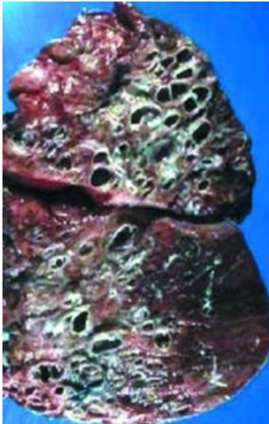
FIGURE 1. Cystic fibrosis of the lung.