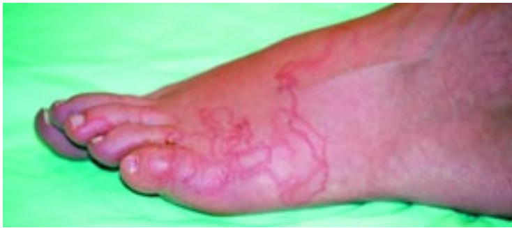
FIGURE 1. Note the serpiginous vesicular erythematous rash on the lateral surface of our patient's left foot.