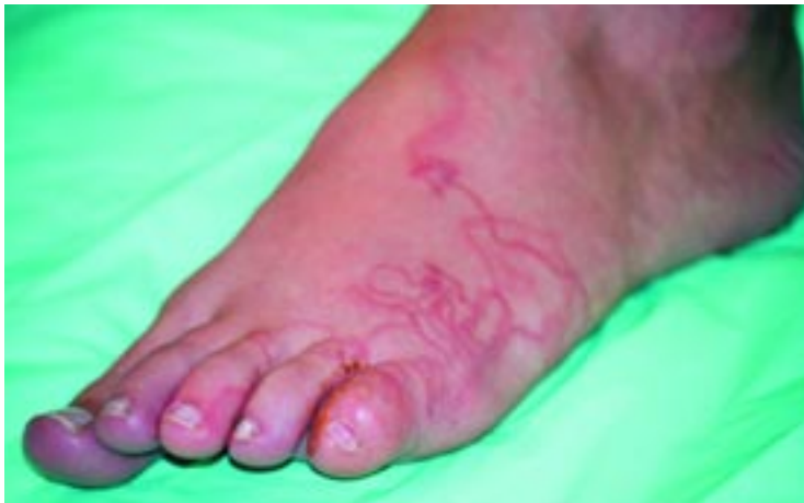
FIGURE 2. Individual larval tracts on the dorsal surface.

A 22-YEAR-OLD WHITE WOMAN presents with redness, rash, and pain in her left foot for the previous 5 days. She says she has not had a fever or chills. She cannot recollect any injury or falls. Before coming to this office, she had gone to an urgent care center, where she received a prescription for cephalexin, which she has taken for the past 2 days, with no improvement.