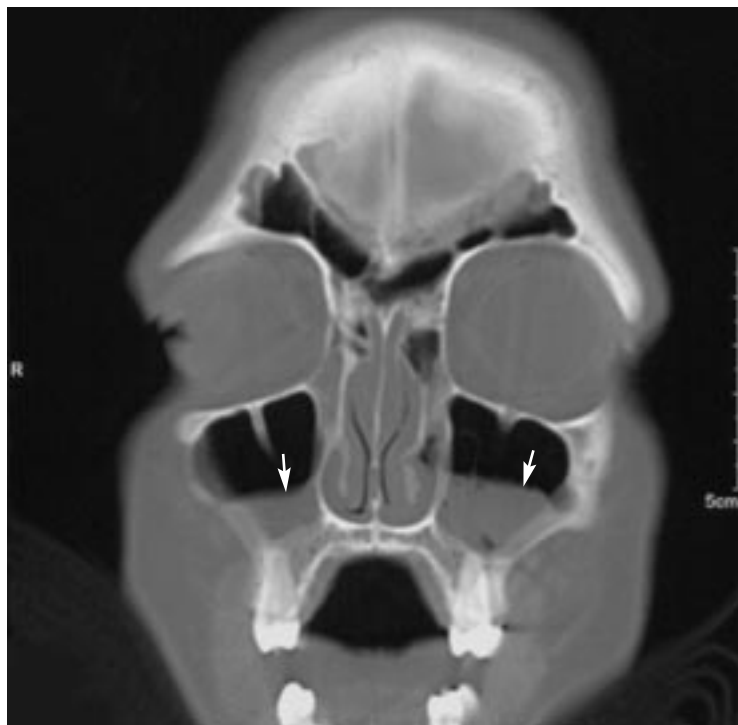
FIGURE 2. CT scan showing acute sinusitis. Note the fluid levels in the maxillary sinuses (arrows). Compare with the normal CT scan in FIGURE 1.

When to order. CT of the sinuses is not necessary if there is a high clinical suspicion of uncomplicated acute sinusitis. It can be ordered to confirm the suspicion of sinusitis before antibiotics are given, especially if complications are a concern. It is also performed preoperatively for visualization of the anatomy.