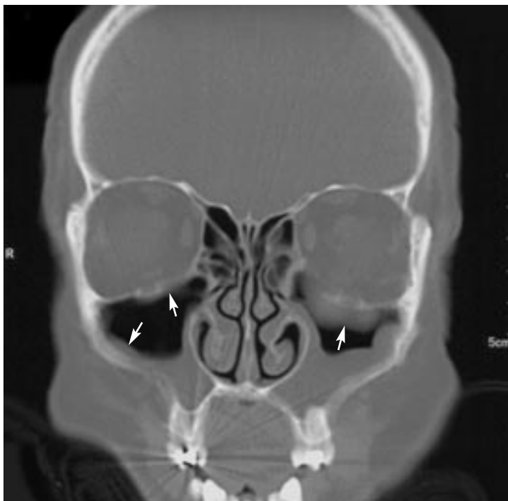
FIGURE 3. CT scan showing chronic sinusitis. Note the mucosal thickening in the maxillary sinuses (arrows).

bone is removed from involved ethmoid sinuses and sinus ostia. This current surgical approach, often done on an outpatient basis, emphasizes the importance of abnormalities in the ostiomeatal complex as predisposing to frontal, ethmoid, and maxillary sinusitis.