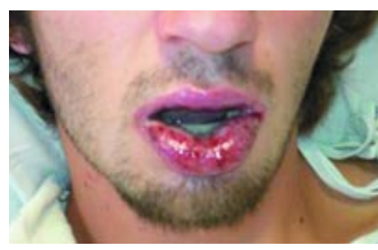
FIGURE 2. Swollen, erythematous lips with ulcerations.

His chest is clear to auscultation. His heart rate is rapid with a regular rhythm; his heart sounds are normal with no murmurs, rubs, or gallops. His abdomen has no palpable organomegaly or significant tenderness. No skin rash is noted. He has no edema in his legs.