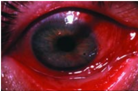
FIGURE 2. Viral conjunctivitis with an intensely red eye and a white fibrin membrane in the inferior fornix.

prone to dryness and irritation. Treatments include artificial tears, lubricating ointments, and surgery—gold weight placement or suturing the eyelid margins (tarsorrhaphy).