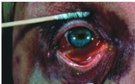
FIGURE 1. Subconjunctival hemorrhage after blunt trauma to the periocular area.