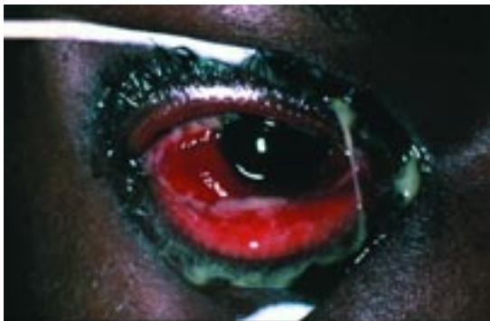
FIGURE 3. Bacterial conjunctivitis. Note pus in inferior fornix and along eyelid margins.