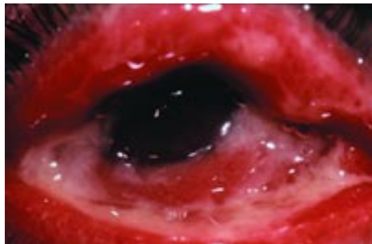
FIGURE 4. Hyperacute conjunctivitis caused by Neisseria gonorrhoeae . Note profuse discharge in a very red eye.

intramuscular injection. 11,12 Because one-third of patients with gonorrheal infection also have chlamydial infection, treatment for both diseases is frequently prescribed.