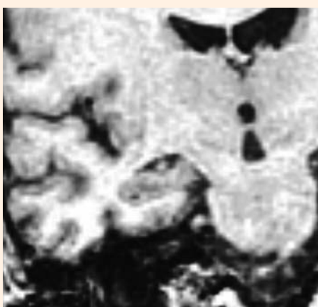
Right hippocampus at 1 year