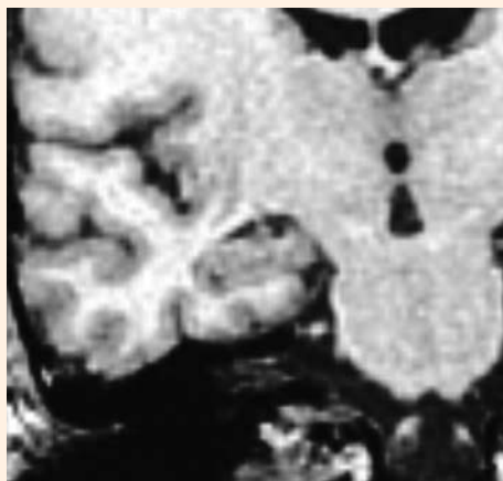
Right hippocampus at baseline