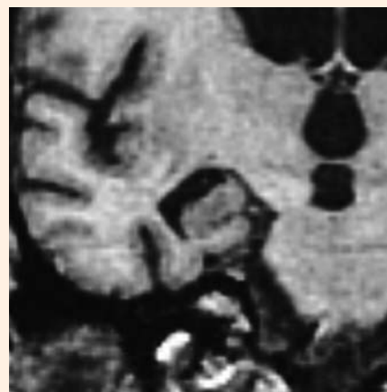
Right hippocampus at baseline