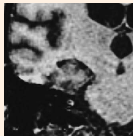
Right hippocampus at 1 year