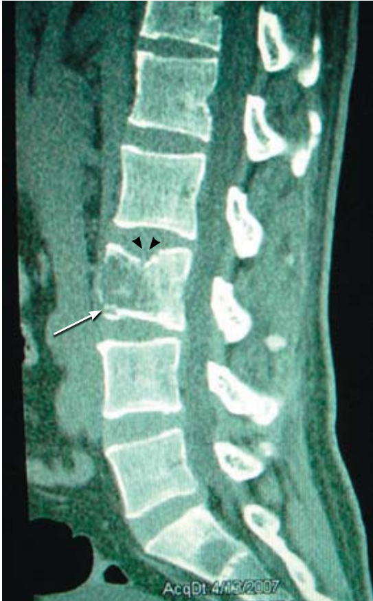
FIGURE 1. A 43-year-old man with a 2-week history of progressive back pain and an abdominal mass. Sagittal CT scan shows an osteolytic lesion of the L3 vertebral body (arrow). The primary tumor was renal. Fracture of the vertebral end plate (arrowheads) may cause first symptoms of pain.