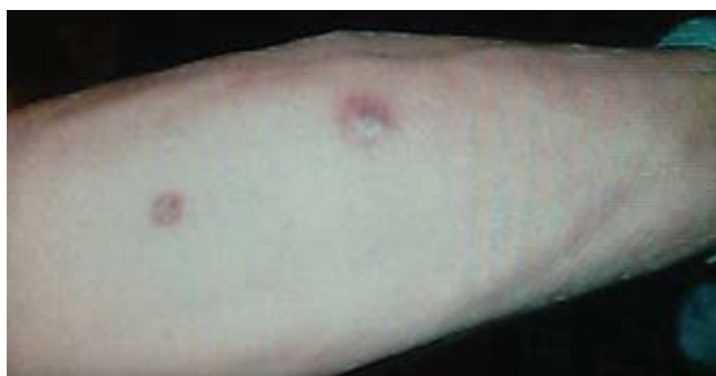
FIGURE 1. Purpuric nodules with surrounding erythema.

A 66-YEAR-OLD WHITE MAN presents with a 1-month history of two nontender, nonpruritic skin lesions on his leg 3 weeks after undergoing bilateral lung transplantation for idiopathic pulmonary fibrosis ( FIGURE 1 ). Except for transient lymphopenia, the post-operative course has been uneventful, with no episodes of rejection. Immunosuppressive drugs include tacrolimus (Prograf) and steroids. He has a history of insulin-dependent diabetes mellitus, and no history of significant trauma to his legs. Other than the skin lesions, he feels well and has no systemic symptoms. He has no history of iron overload or deferoxamine (Desferal) therapy.