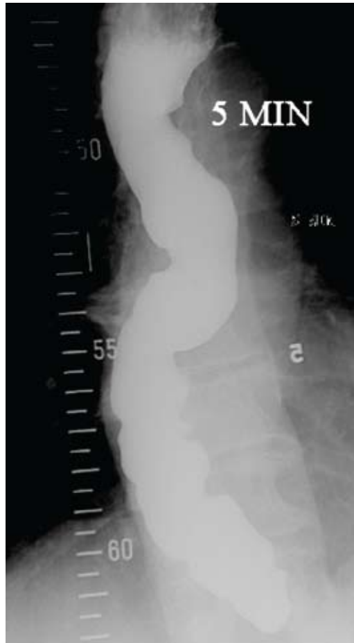
FIGURE 1. Timed barium swallow in a patient with achalasia. The patient consumed 140 mL of low-density barium. There is no emptying of barium between the 1-minute and 5-minute films.

ten, both an oropharyngeal examination, performed by a speech and language pathologist, and an esophageal examination, performed by a radiologist, are ordered.