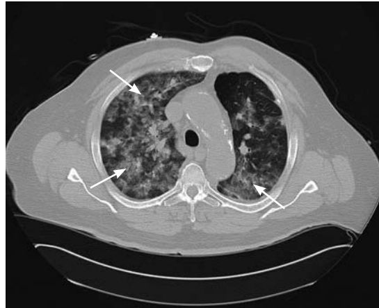
FIGURE 3. Computed tomography of the chest reveals diffuse reticular nodular densities associated with ground-glass attenuation in the areas identified on the chest radiograph.

Ground-glass attenuation implies focal or diffuse opacification of the lung that does not obscure the vascular structures, is not associated with air bronchograms, and appears as a "veil" across the lung parenchyma. 1 It can be seen in acute diseases such as infection (including pneumonia from atypical bacteria, viruses, acid-fast bacilli, and Pneumocystis jiroveci ), pulmonary hemorrhage of