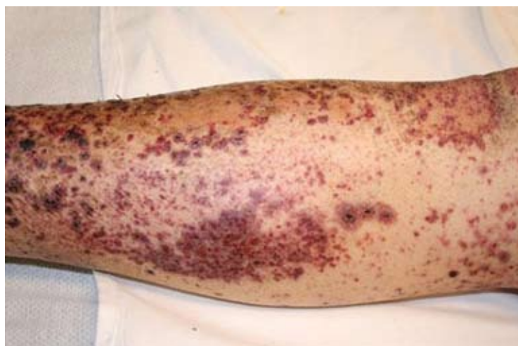
FIGURE 1. Diffuse, nonblanching, petechial-purpuric rash with scaling on both legs and extending up to the abdomen, flanks, chest, and both arms.

Vital signs. Oral temperature 101.1°F (38.4°C), pulse rate 108, blood pressure 108/79 mm/Hg, respiratory rate 22, oxygen saturation 93% by pulse oximetry on room air, weight 94 kg (207 lb).