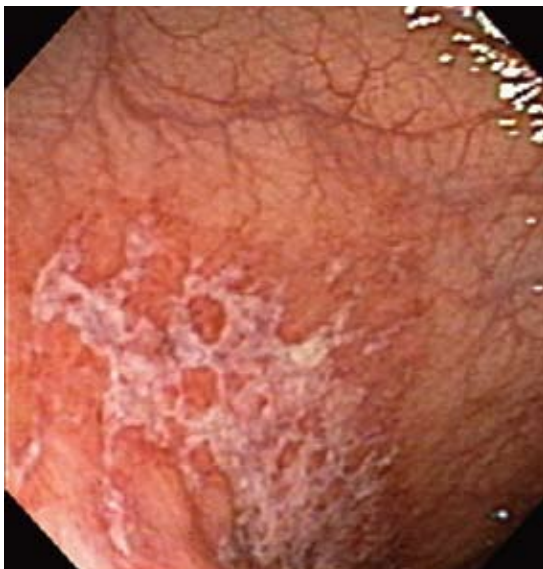
FIGURE 2. Mildly active ischemic colitis with a large superficial ulcer in the watershed area of the splenic flexure.