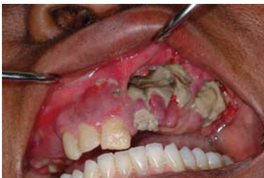
FIGURE 5. Osteonecrosis of the jaw.

REPRODUCED FROM RUGGIERO SL, MEHROTRA H, ROSENBERG TJ, ENGROFF SL. OSTEONECROSIS OF THE JAWS ASSOCIATED WITH THE USE OF BISPHOSPHONATES: A REVIEW OF 63 CASES. J ORAL MAXILLOFACIAL SURG 2004; 62:527-534, WITH PERMISSION FROM ELSEVIER. WWW.SCIENCEDIRECT.COM/SCIENCE/JOURNAL/02782391.