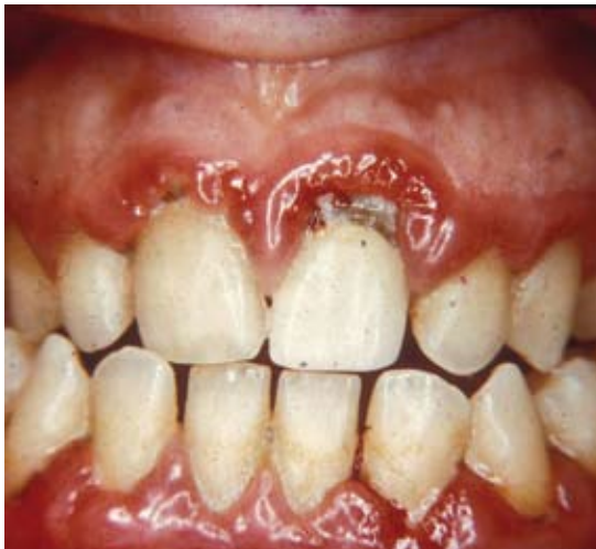
FIGURE 3. Red swollen gums with pus in periodontitis.

Norderyd et al, 23 in a cross-sectional study, found less periodontal disease in postmenopausal women who were on estrogen therapy than in those who were not, although the difference was not statistically significant.