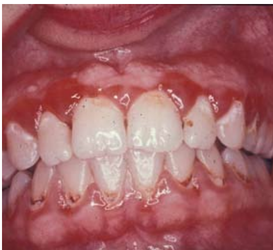
FIGURE 1. Red swollen gums of gingivitis.

If unchecked, gingivitis progresses to periodontitis, an inflammation of the supporting tissues of the teeth, including the gingiva, alveolar bone, and periodontal ligament (FIGURE 2). Periodontitis leads to progressive and irreversible loss of bone and periodontal ligament attachment, as inflammation extends from the gingiva into adjacent bone and ligament. Signs and symptoms of progressing periodontitis include red, swollen gums that may appear to have pulled away from the teeth, persistent bad breath, pus between the teeth and gums (FIGURE 3), loose or separating teeth, and the common complaint that “my teeth don’t fit together anymore.”