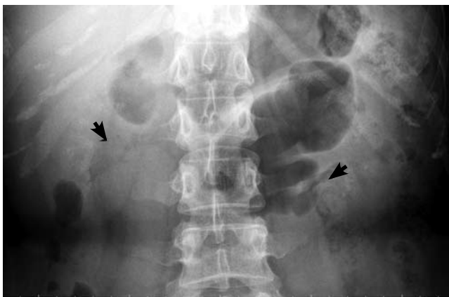
FIGURE 1. Radiograph, kidney-ureter-bladder view, showing multiple radiopaque densities (arrowheads) within bilateral renal shadows.