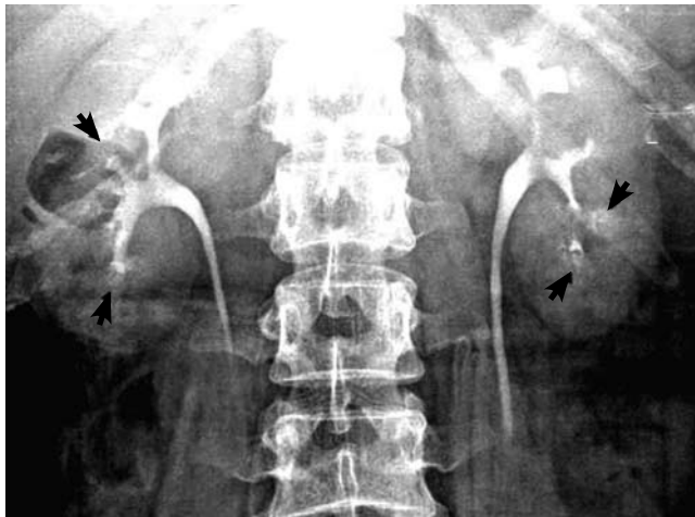
FIGURE 3. Intravenous urogram at 10 minutes demonstrating the bright brush-like or “paintbrush” pattern (arrowheads) of contrast collection along ectatic medullary collecting tubules uniformly directing the cupping of papillae.

More than 70% of patients with medullary sponge kidney develop stones