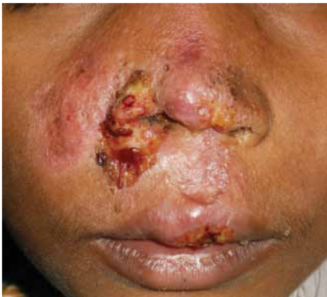
FIGURE 1. Ulcerated plaque with destruction of the right nasal wing.