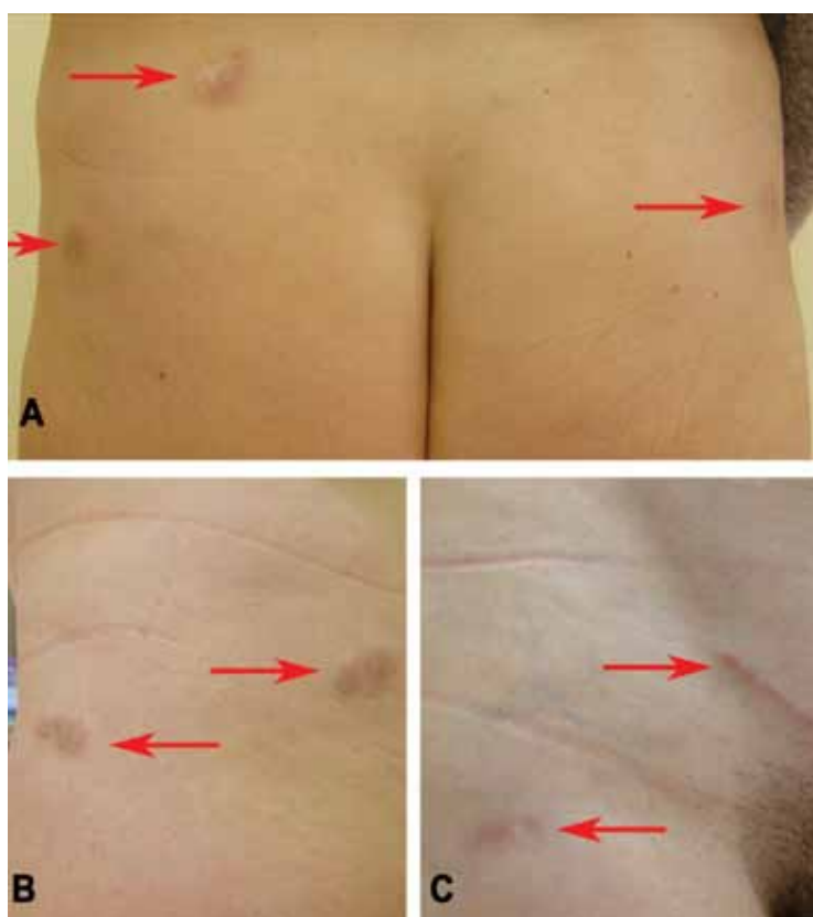
FIGURE 1. Indurated and painful brownish-red plaques localized on old scars: (A) lower trunk, (B) left side, (C) right side.

A: All are appropriate at this point. In this case, skin biopsy and high-resolution CT were performed. Histopathologic examination of one of the scars showed multiple well-demarcated, large, noncaseating epithelioid granulomas with histiocytes and multinucleated giant cells. High-resolution CT confirmed bilateral hilar and mediastinal lymphadenopathy and revealed micronodular densities with a bronchovascular and subpleural distribution.