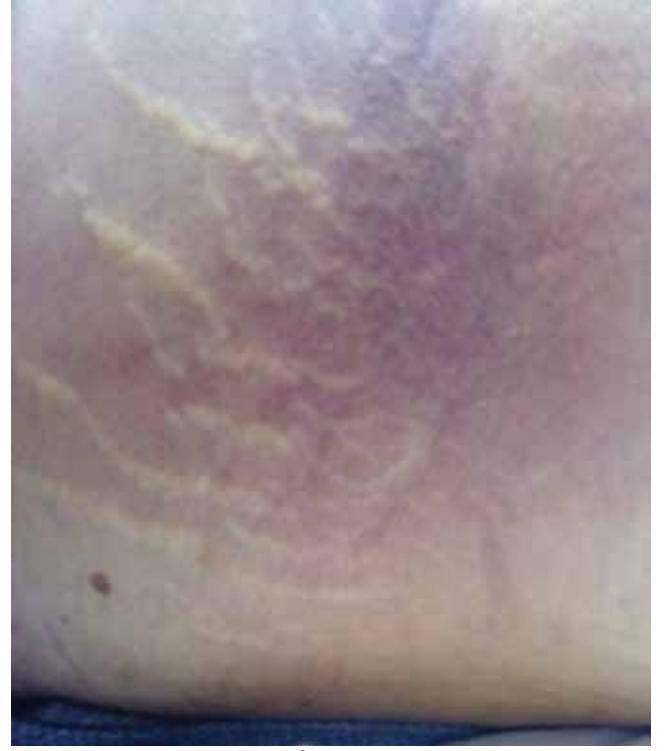
FIGURE 2. Grey Turner sign.

from 30.3% to 17.8% (reference range 41–50). He was transferred to the intensive care unit. A do-not-resuscitate order was instituted, and he died 12 hours later.