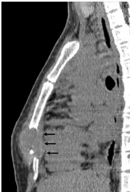
FIGURE 1. Sagittal computed tomography of the chest shows a soft-tissue density, 3 × 2 × 3 cm, causing bony destruction of the inferior sternum (arrows).

A 26-YEAR-OLD FILIPINO WOMAN presented for evaluation of sternal pain associated with a palpable mass that she had noticed 8 months earlier. She had no history of significant medical illness. She had recently immi-