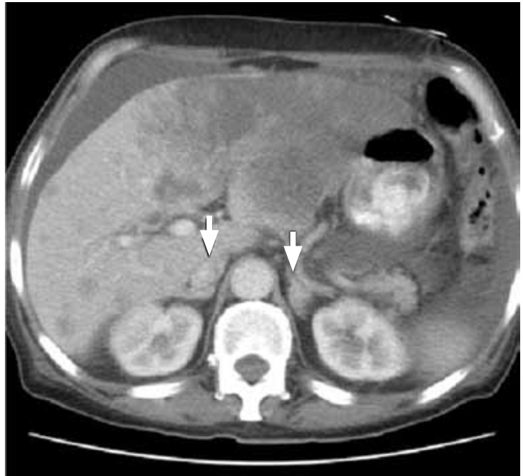
FIGURE 4. Computed tomography of the abdomen showed enlarged adrenal glands (arrows).

Once primary adrenal insufficiency is suspected, prompt diagnosis and treatment are essential. A low plasma cortisol level ( < 3 \mu\text{g/dL} ) at 8 AM is highly suggestive of adrenal insufficiency if exposure to exogenous glucocorticoids has been excluded (including oral, inhaled, and injected), 12,13 especially if ac-