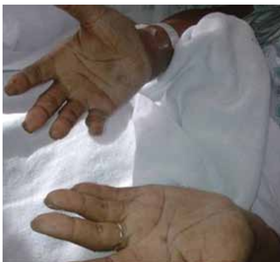
FIGURE 1. The patient has hyperpigmentation of the skin creases on the palms, as well as on the lips and the lower gum.

A 65-YEAR-OLD MAN PRESENTS with a 2-month history of generalized weakness, dizziness, and blurred vision. His symptoms began gradually and have been progressing over the last few weeks, so that they now affect his ability to perform normal daily activities.